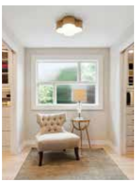
Gold Award – Addition

Each year, NARI-MN presents RotY awards to members who have demonstrated outstanding work.