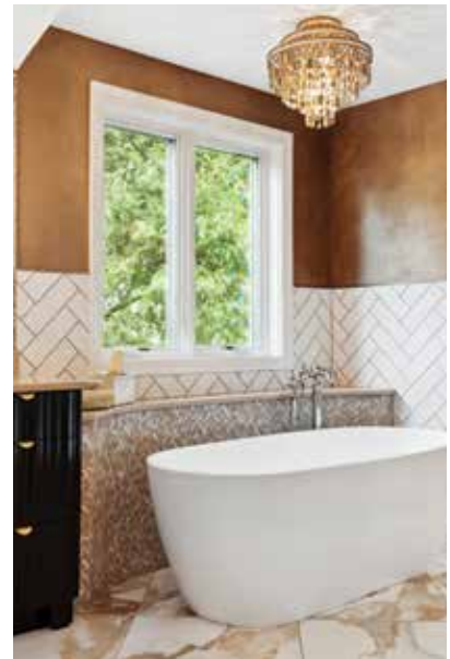
A redesigned floor plan allowed for a luxurious free-standing soaking tub.

Contact Us Today for a Complimentary Remodeling Consultation!