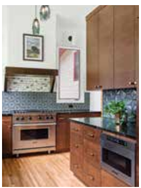
Gold Award – Kitchen

Plekkenpol Builders wins GOLD in two categories!