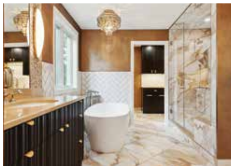
Marble-look porcelain floor and wall tile