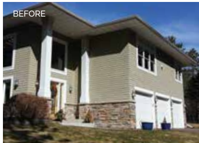
Prior to remodeling, the home had a traditional exterior design.

No strangers to extreme home renovations, the owners had undergone three major remodels in the past 30 years. First, an addition off the front of the house. Second, a sleek and modern update to the interior. Most recently, a dramatic exterior renovation including new ceramic panel siding, new doors and new oversize, triple-pane windows. The bold transformation from traditional to ultra-contemporary reflects the owners' taste and the modern aesthetic throughout the rest of the home.