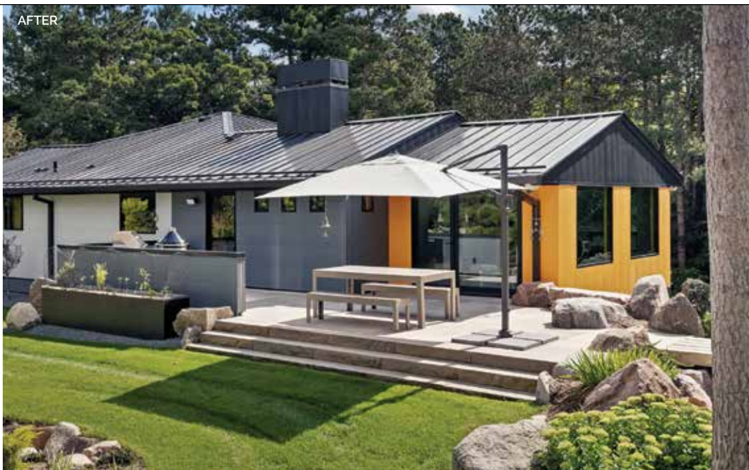
The exterior was influenced by the style and simplicity of Japanese design.

The finished result is a home fully integrated with its surroundings. The patio, deck and extensive landscaping create a calm and restorative environment. The water features and wildlife can be enjoyed from every room. The new backyard patio is easily accessed from the sunroom through new sliding glass doors.