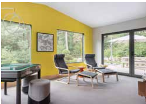
The new patio is accessed from the sunroom.