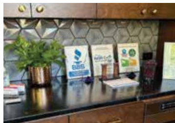
Fall Showcase Home R39

If you missed the Showcase, photos of this home, as well as past Showcases, can be viewed on our website at plekkenpol.com/gallery/showcase .