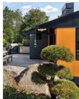
The surrounding gardens create a calming escape.