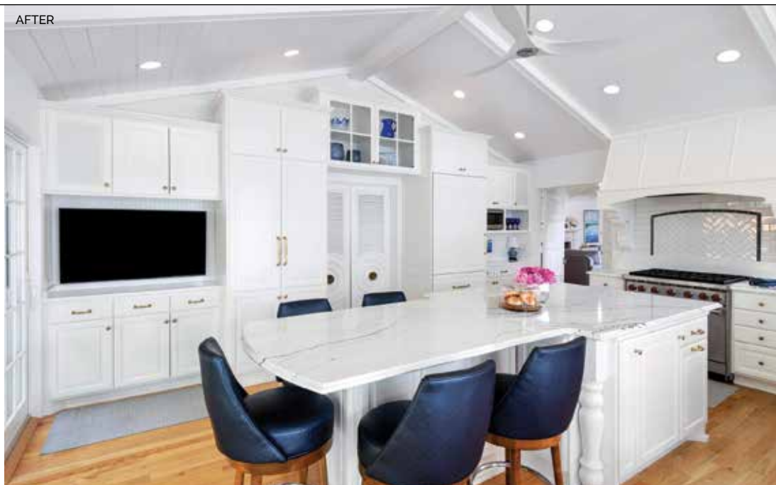
2023 NARI Contractor of the Year GOLD Award Winner – Kitchen $150,000 to $200,000

The detailed doors leading to the dining room were a key architectural element that were retained and refinished. Cabinets up and over the doorway emphasize the height of the vaulted ceiling.