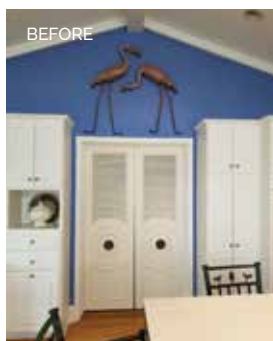
Detailed doors, a key architectural element, were refinished.