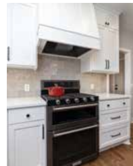
Spring Showcase Home April 5-7, 2024

If you missed the Showcase weekend, photos of this home, as well as past Showcase homes, can be viewed on our website at www.plekkenpol.com/gallery/showcase .