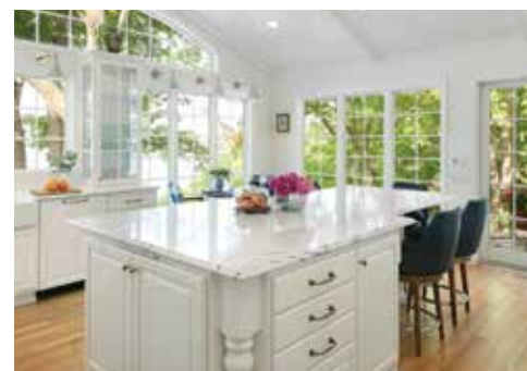
The new, larger island offers views of the lake.