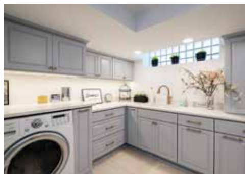
Region 3 North Central Winner

Winning a Regional CotY Award is a distinguished honor, and we are thrilled to receive this recognition!