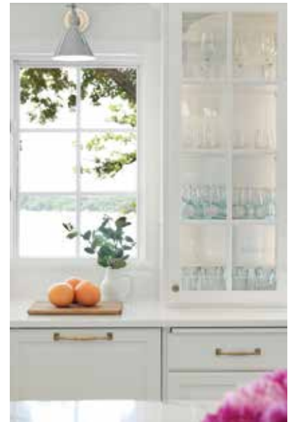
The existing kitchen did not reflect the home's charm and character.

Contact Us Today for a Complimentary Remodeling Consultation!