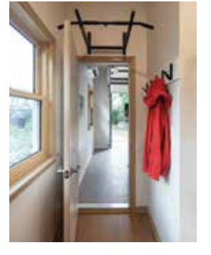
Doorway to storage shed