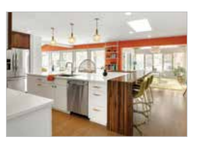
Vibrant & Open Main Level Remodel

The weekend weather went from rainstorms to record October heat, but that didn't keep people away. Our visitors loved the dramatic transformation, open floor plan and detailed workmanship.