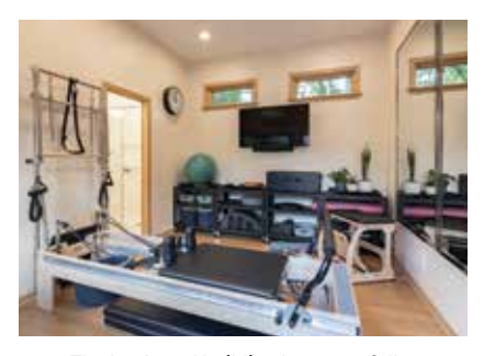
The backyard building houses a fullyequipped Pilates studio and fitness area

One discussion lead to another, and the family decided to move ahead with construction of a backyard outbuilding they'd been contemplating a multi-purpose space that would be used as halfstorage shed and half-exercise/Pilates studio.