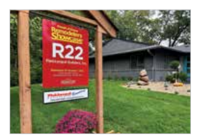
Fall Showcase Home R22

We would like to thank everyone who toured our colorful kitchen and main level remodel in Minnetonka during the 2023 Fall Parade of Homes Remodelers Showcase!