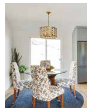
New patio door for backyard access