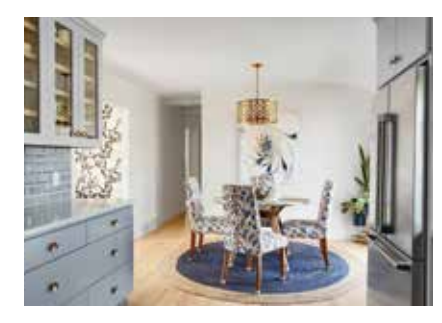
After remodeling, the kitchen feels open, spacious and contemporary.

The kitchen's U-shaped layout created tight corners and was prone to traffic jams. A peninsula divided the space, and low-hanging cabinets cut off sightlines. Accessing storage was difficult. Small windows obstructed the flow of light. The owners wanted to update and modernize their home, with creative space planning their number-one priority.