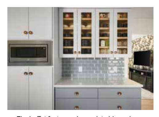
The buffet features glossy slate blue subway tile and a polished white quartz countertop.

The antique cabinet knobs are upcycled from a different Plekkenpol project! After being cleaned and polished, they are a unique retro element in the room.