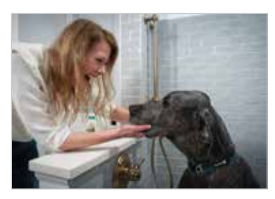
Luxury dog wash

Plekkenpol Builders was featured in the StarTribune Home & Garden section on May 19 in an article spotlighting "barkitecture" – pet-friendly amenities at the center of home design.