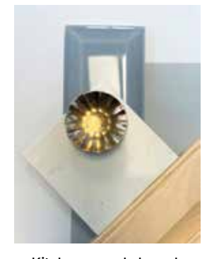
Kitchen sample board and antique knob