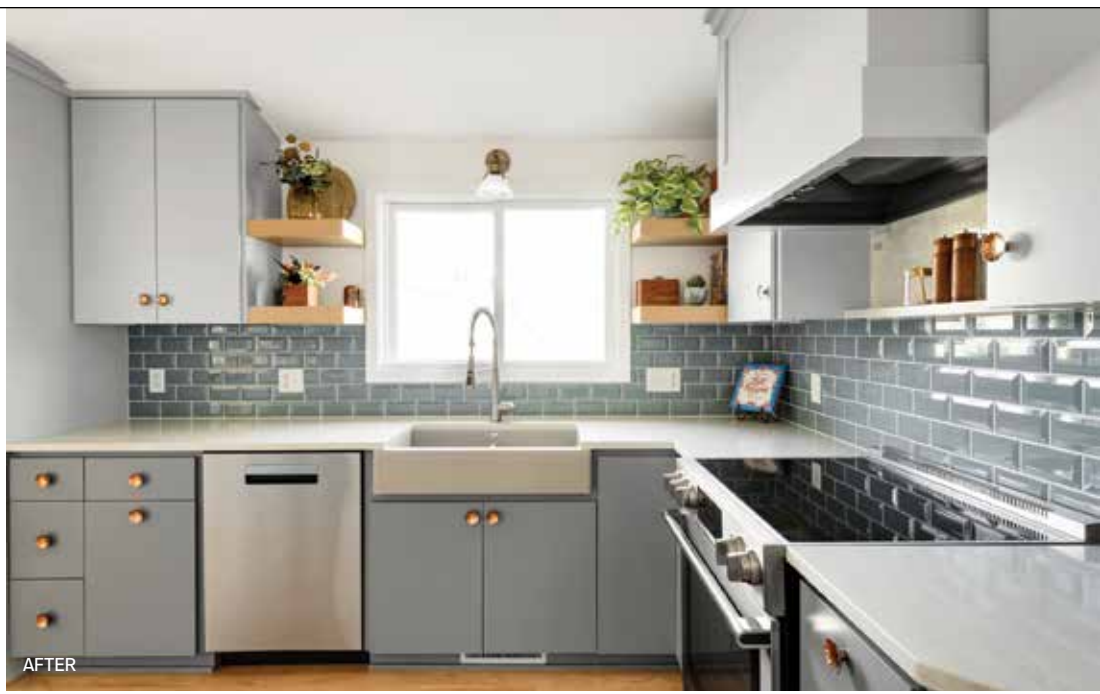
The window above the kitchen sink was enlarged to invite in natural light. Floating shelves frame the window.