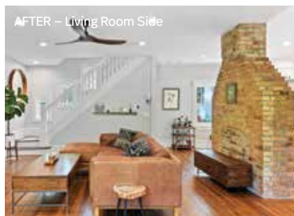
AFTER – Living Room Side