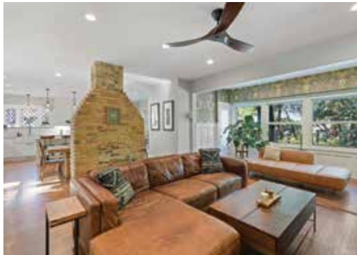
The wood-wrapped sun room with its wall of lake-facing windows sits just off the living room.

The foyer was opened by relocating the powder room and eliminating a front closet (far right). This provided space for a mud room area between the front door and sliding patio doors. Wood paneled walls in the new powder room match the walls in the sun room.