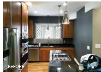
The kitchen was opened and reconfigured to maximize space.

Contact Us Today for a Complimentary Remodeling Consultation!