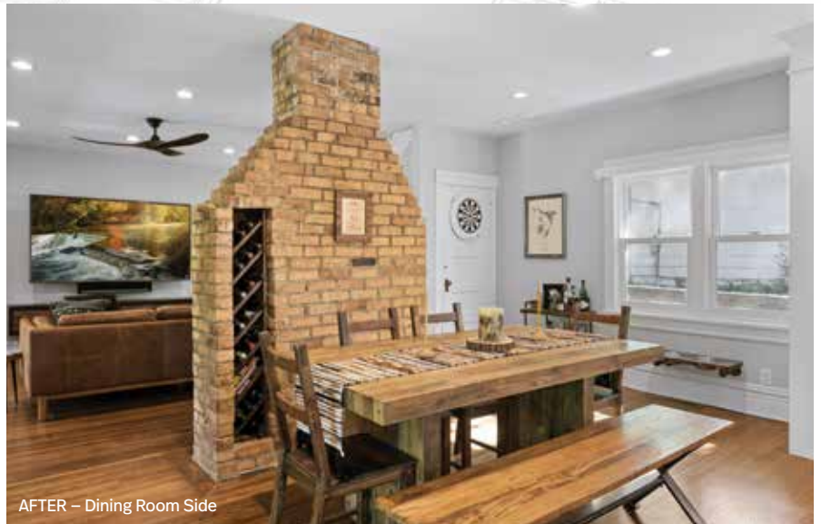
AFTER – Dining Room Side