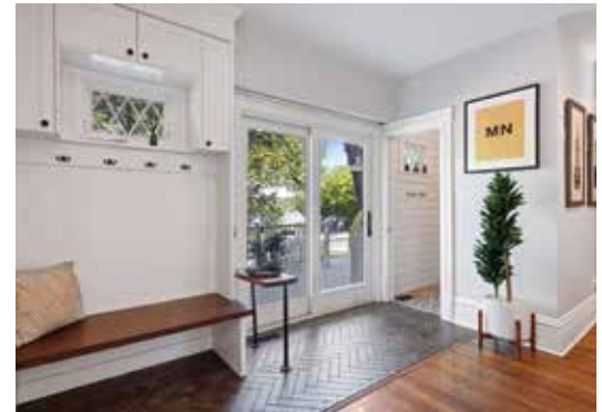
A built-in bench, hooks and overhead cabinets serve as a mud room. The powder room is on the right.