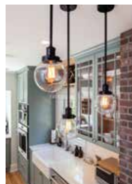
The wall separating the kitchen and dining room was removed.