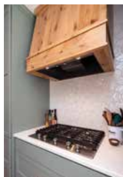
The range was relocated to create a more efficient work zone.