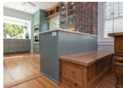
A built-in bench on the dining room side of the peninsula comes with space-saving storage.

Contact Us Today for a Complimentary Remodeling Consultation!