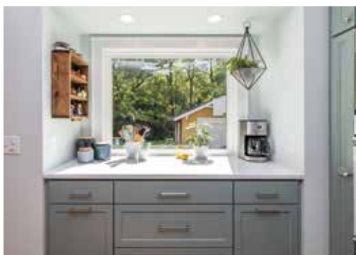
The bump-out added eight feet of functional cabinet and counter space.

With better space planning, we were even able to find some lost closet space for the owner's office behind the range wall! "We've been through home improvement projects in the past, and this one blew them all away," said the owners. "From concept to completion, you exceeded our every expectation."