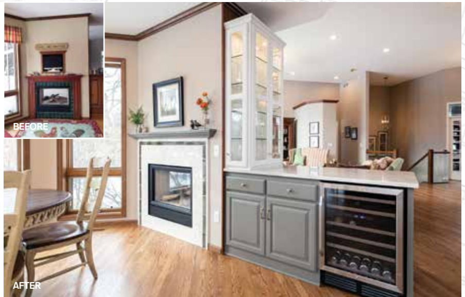
The fireplace facade is a creamy handcrafted tile with a crackle glaze that is enhanced by subtle variations.