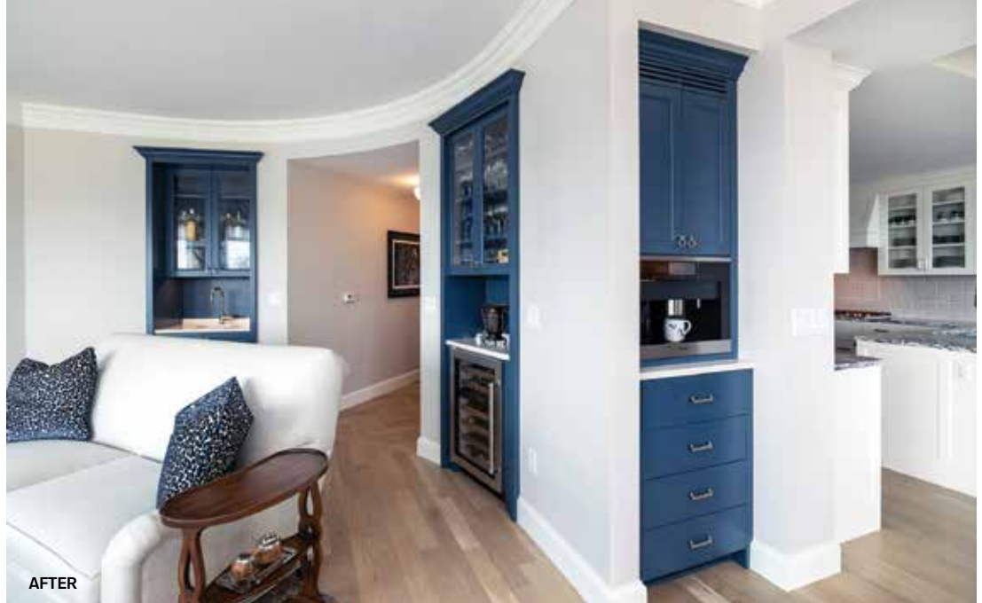
Vibrant navy blue is seen in the wet bar, beverage station, coffee bar and family room bookcase.