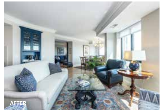
Raising the ceilings opened and brightened the space.