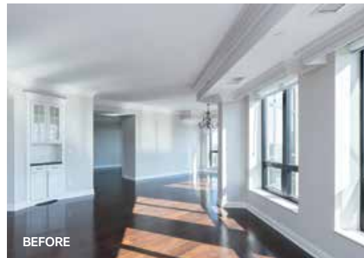
Existing two-tier crown molding obstructed the view.

Above all, they wanted to maximize the amazing view from the 19th floor. The biggest impact was removing the two layers of crown molding to raise the ceilings. This both modernized the space and provided the maximum amount of unobstructed viewing.