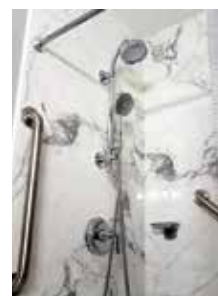
Modifications often include grab bars

Project Manager Pam Velander discussed common renovations that enable senior citizens to stay in their homes rather than move to assisted living. The goal often is to reconfigure spaces to allow access for walkers and/or wheelchairs. Renovations usually involve bathrooms and kitchens, and often include things like adding grab bars and cabinet shelves that roll out.