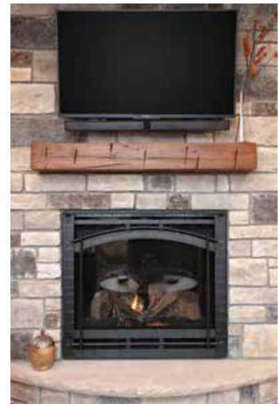
Refaced stone fireplace