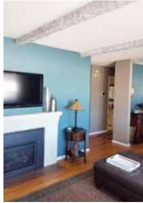
Living Room BEFORE