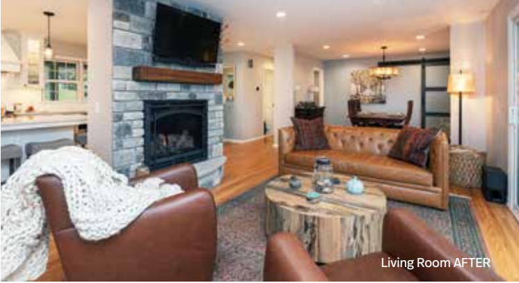
Living Room AFTER