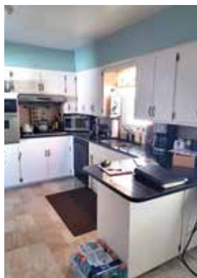
Kitchen BEFORE: Inefficient, dated and closed off

Get a first look at our 2019 Spring Remodelers' Showcase home, a gorgeous kitchen, bath and main level remodel on Duck Lake