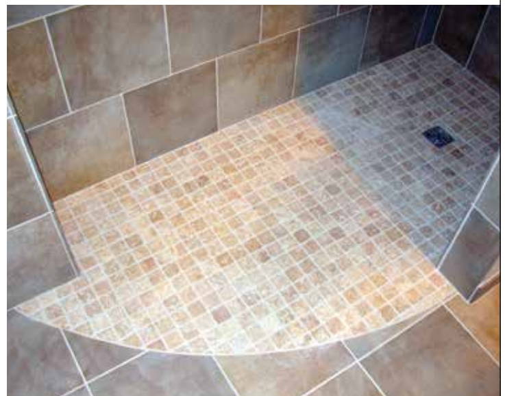
A curbless, roll-in shower is ideal for someone with limited mobility.