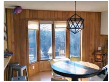
Dining Room BEFORE