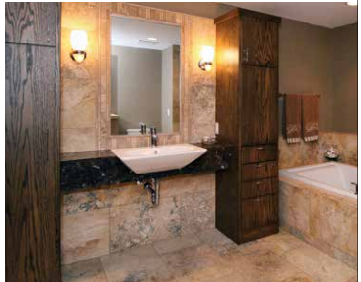
A bathroom vanity that is open below can accommodate a wheelchair or walker.