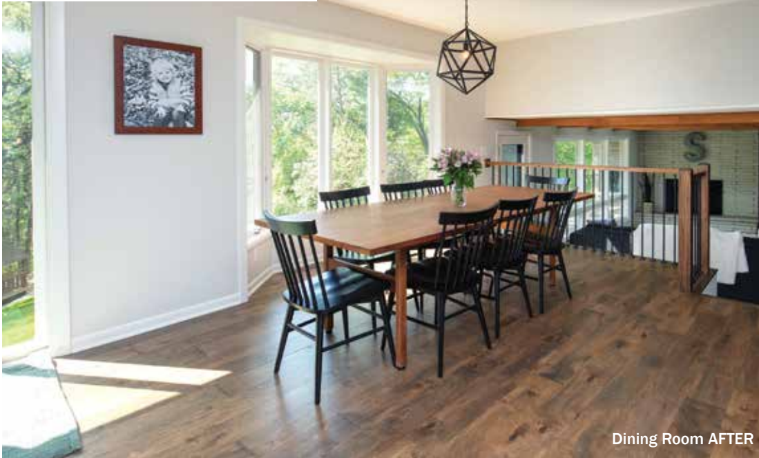
Dining Room AFTER