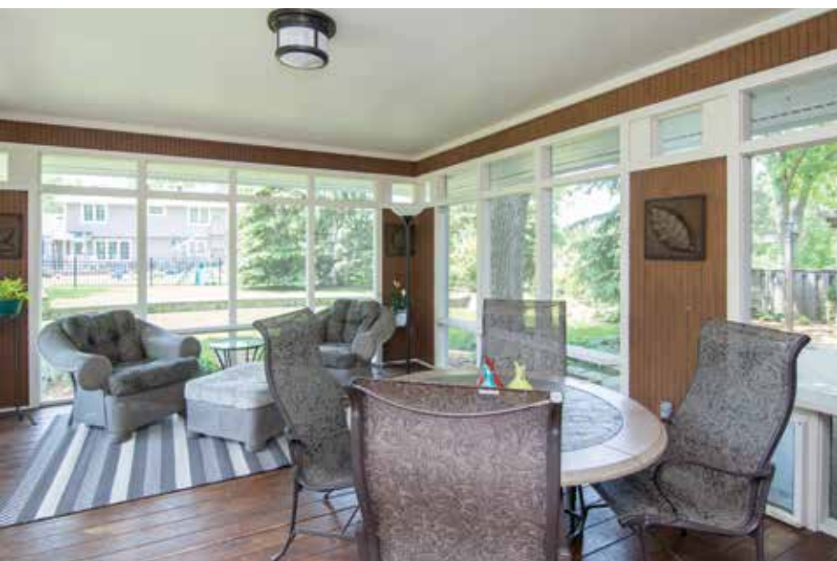
Relaxing on a three-season porch is the perfect way to enjoy Minnesota's changing seasons.