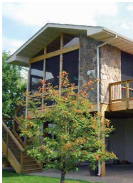
Interior and exterior views of a three-season porch complete with fireplace and wall-mounted TV.