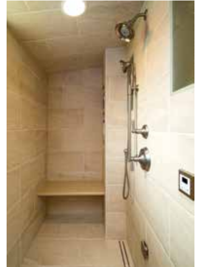
The steam shower features transparent interior panels (upper right) that allow for light transfer.

The floorplans below show how the extra bedroom was transformed into the master suite's new walk-in closet. In addition, the floorplan itself became more functional and user-friendly.