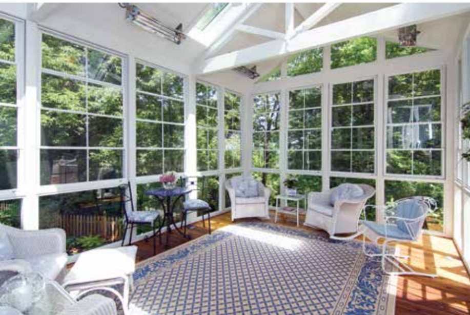
Beautiful three-season porch with an exposed beam vaulted ceiling and infrared heaters.