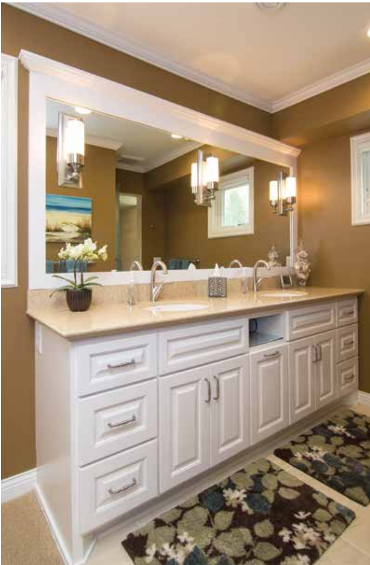
The double vanity is custom made and features a natural quartz countertop and vibrant brushed nickel faucets.

"In all, we feel that Plekkenpol Builders has provided us a high quality team that completed high quality work," say the homeowners. "You have helped us modernize our home from its 1960s style to a comfortable floor plan that we enjoy every day. Obviously we would use your company again and wouldn't hesitate to recommend your services to others."